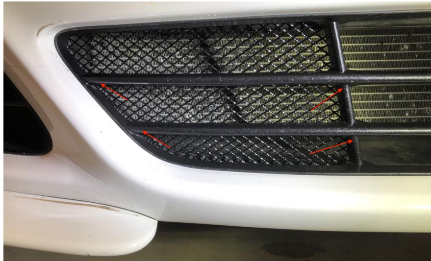
Figure 1. Right end section of Front Center Grille in position.